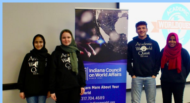
Eman School - Fishers Team 2 - 1st Place

Indiana Council on World Affairs, Inc. Academic WorldQuest 2020 February 15, 2020, University of Indianapolis