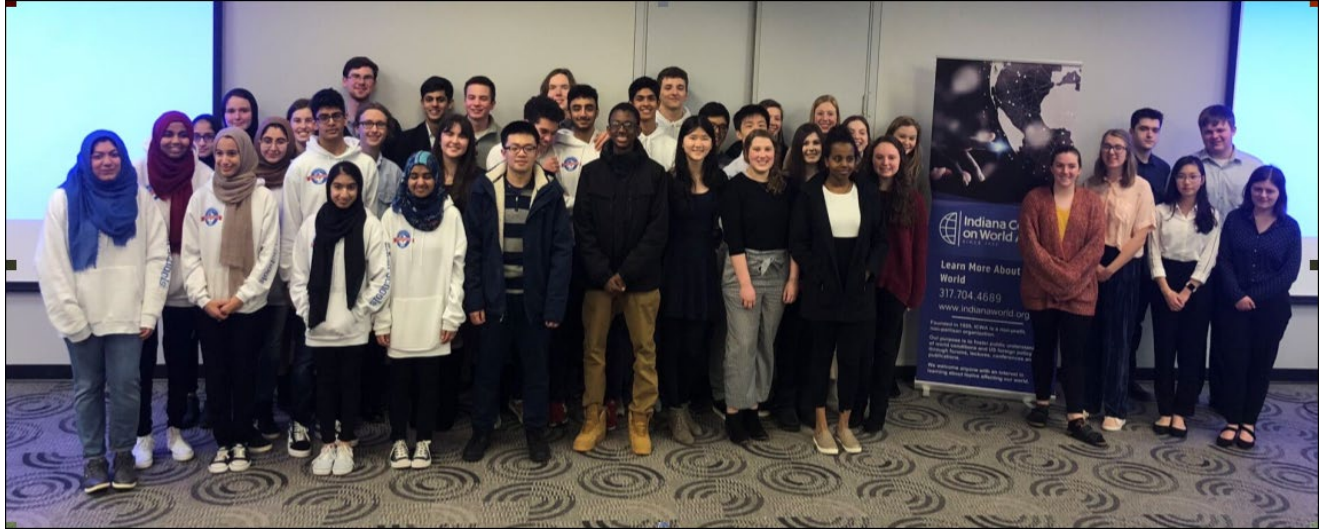
Indiana Council on World Affairs, Academic WorldQuest 2019 - High School Students Participants