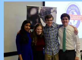
Carmel High School Team 4 - 2nd Place Tie