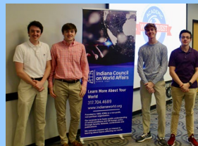
Carmel High School Team 3 - 2nd Place Tie